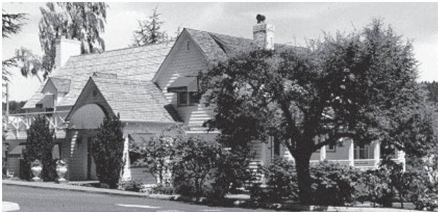
Monte Villa Farmhouse

Columbia Viognier from Red Willow Vineyards Chateau Ste. Michelle Riesling from Columbia Valley Blue Pirate Pinot Noir from Wilamette Valley DeLille 2003 Blend of D2, Chaleur Estate and Harrison Hill Alder Ridge Cabernet Sauvignon from Horse Heaven Hills Sawtooth Winery Late Harvest Gewurtztraminer Reserve